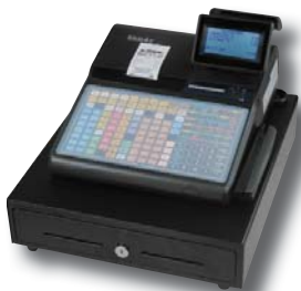
SPS-320 Flat Spill-Resistant Keyboard; Receipt Printer