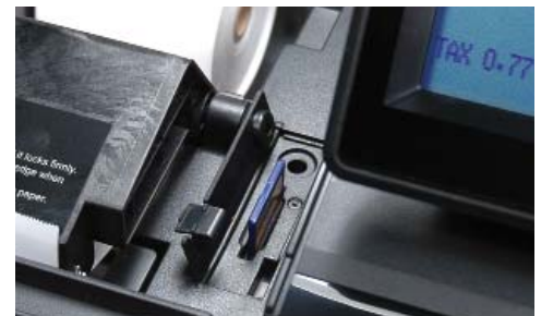
SD Port Hidden Under The Printer Cover Is Secure From Tampering