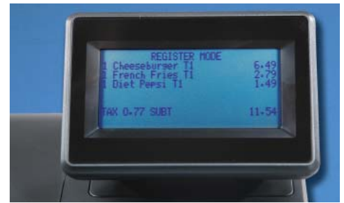
Eight-Line By 32-Character LCD Operator Screen