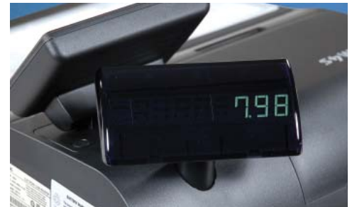
9-Digit LED Customer Turret Display