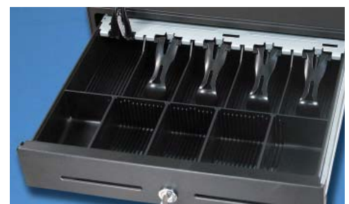
2 Media Slot Drawer With Extra Deep Insert And Adjustable Coin Dividers