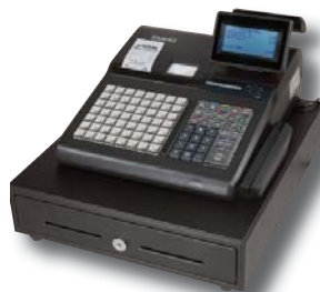
SPS-345 Raised-Key Keyboard (Expanded); Receipt And Journal Printers