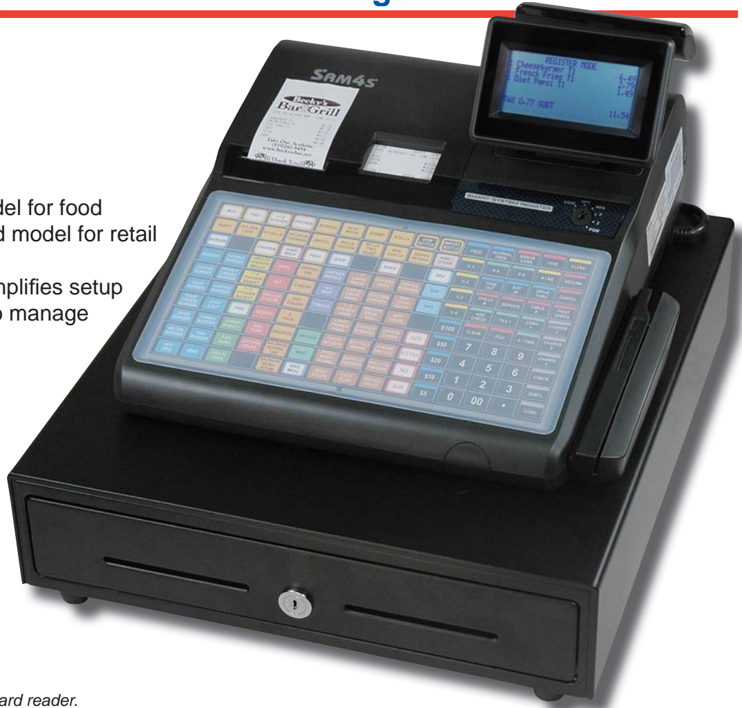
SAM4s SPS-340 shown with optional card reader.