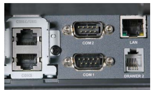
Up To 4 RS-232C Ports Hidden Behind A Convenient, Easy To Access Door