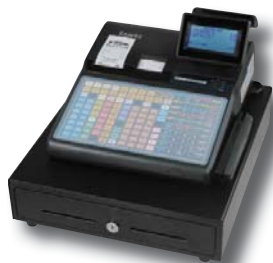
SPS-340 Flat Spill-Resistant Keyboard; Receipt And Journal Printers